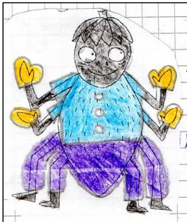
I'm a spider. I'm wearing two pairs of yellow gloves, a light blue T-shirt, violet trousers and four black shoes.